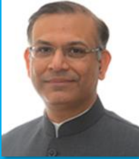
Jayant Sinha Member of Parliament (Lok Sabha) Government of India

Mr. Sinha is a second term Member of Parliament from Jharkhand, India. He won his Lok Sabha elections in 2014 and 2019 with record margins. As Chairperson of the Standing Committee for Finance, he leads the 31 member Parliamentary panel that has oversight of the Ministries of Finance, Corporate Affairs, Statistics & Program Implementation, and the NITI Aayog (the government planning agency). In addition, the panel has Parliamentary responsibility for the Reserve Bank of India, the Securities & Exchange Board of India, the Insolvency & Bankruptcy Board, and the Insurance and Pension regulatory authorities.