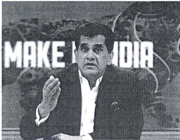
NITI Aayog CEO Amitabh Kant

"We will work with them (state government) to focus on outcomes of the joint working group," National Institution for Transforming India (NITI) Aayog Chief Executive Amitabh Kant told reporters on the sidelines of