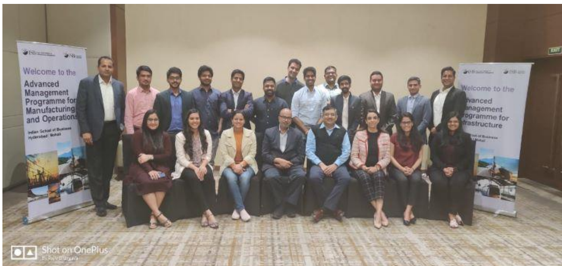
Students of Join Residency of AMPMO and AMPI Co2021 present in person for Residency 1