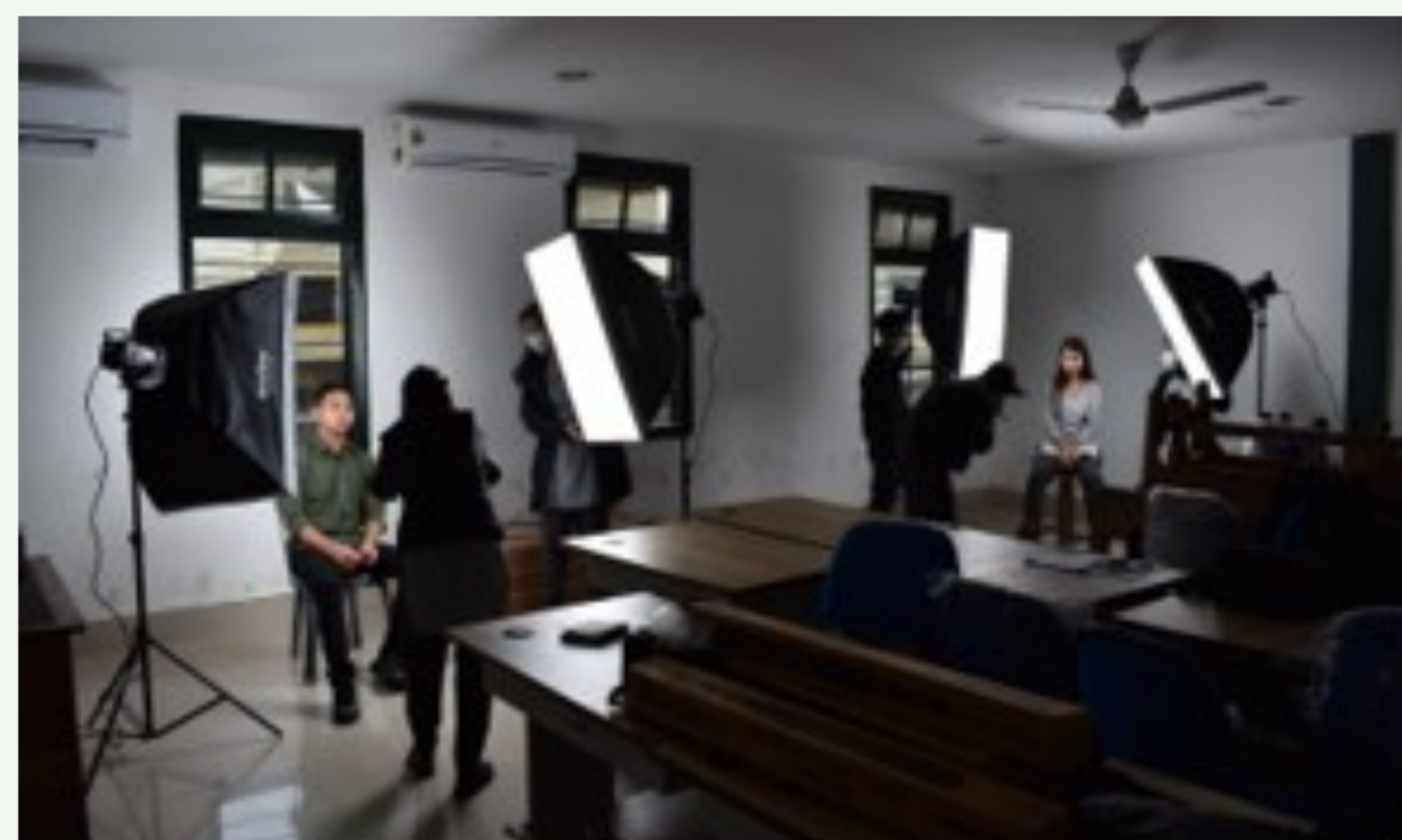
Image 2: Learning/enhancing skills in demand is crucial in present times