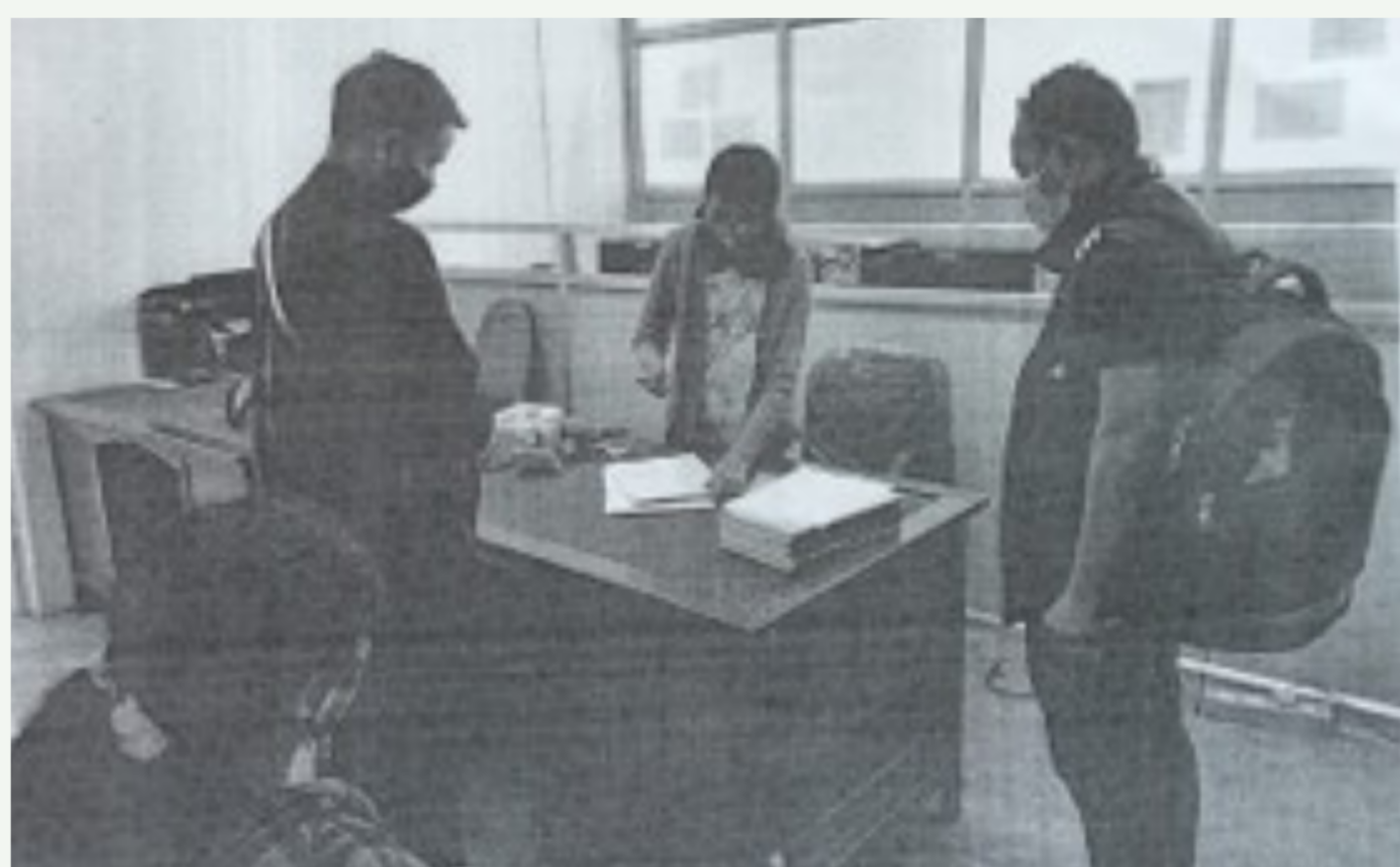
Image 1: At the directorate of Employment and Craftsmen Training, job seekers are seen being guided in filling up registration forms

•This limits the population from engaging in productive economic activities